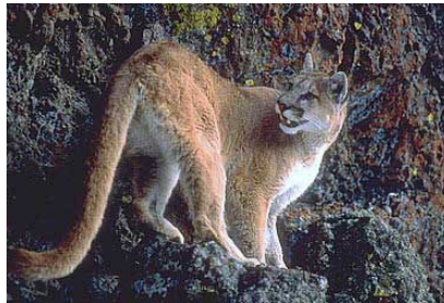
Mountain lions average between 75 and 150 pounds, are a tawny gold, have very long tails and have wide-set ears.