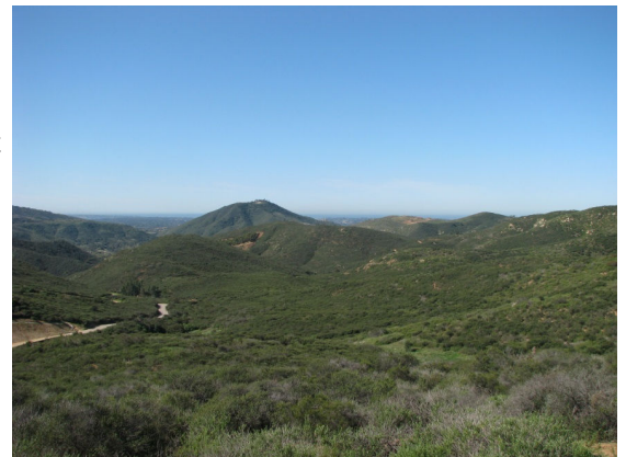
Family Stations 120 acres

With this in mind TECC has moved forward on numerous acquisition projects. We recently entered into escrow on a 120 acre parcel known as Family Stations. This is a key acquisition if we have any hope of preserving the huge area of open space that exists between the City of San Marcos, Elfin Forest, and Harmony Grove. It is the 120 acres that is across Harmony Grove Rd. (north side) from the parking lot of the Elfin Forest Recreational Reserve that goes up into a beautiful bowl in the hills above the Escondido Creek Canyon. We are in the process of getting appraisals, HazMat clearances, and funding lined up to complete the transaction.