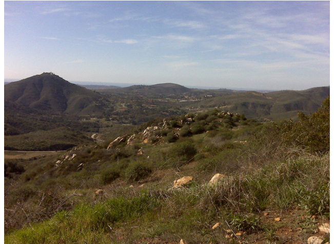
Elfin Forest from the Way Up Trail

The Town Council motto is “ keep it rural ”. What better way to keep it rural than to try to do our part to preserve the hundreds of acres of open space in our community as permanent open space? Of course The Escondido Creek Conservancy (TECC), started back in 1991 by several of your neighbors, is the preeminent local organization that deals with land acquisition and stewardship, and to date has been instrumental in saving over 1,000 acres of open space. Like all conservancies and land trusts, they bring expertise in biological issues and the ability to look after high value open space after it has been purchased. The role of the Town Council is complementary to TECC's, and spans the following areas: