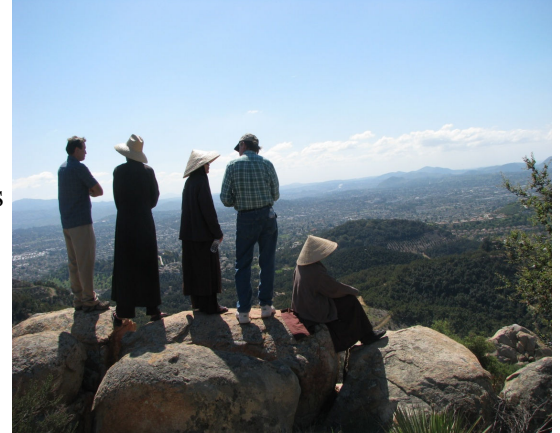
Council Springs Ridge overlooking Escondido

since TECC purchased what is now the 350 acres Del Dios Highlands County Park adjacent to the Elfin Forest Recreational Reserve. These are the projects that we are openly discussing at this point. There are several others that are being developed. Each one of these projects is dependent on your continued financial support. There has been no other time in the history of TECC in which we could leverage your donation so effectively toward open space and habitat preservation. The residents of this neighborhood are donating time and money to the effort to acquire Council Springs Ridge.